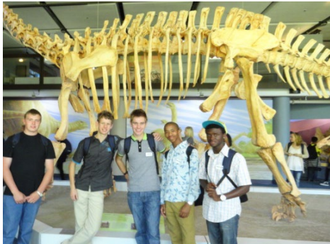
Iziko Museum, CT