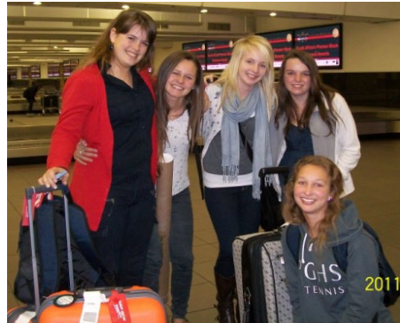
Flying for the first time!